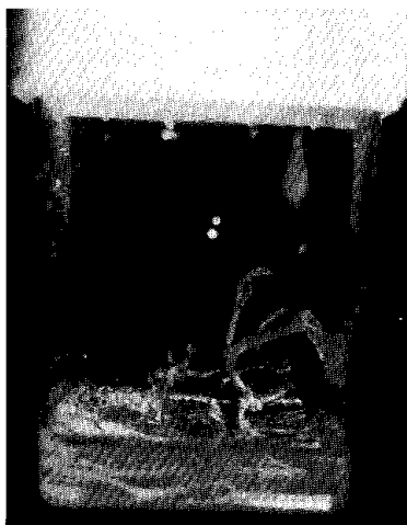
Fig. 3 Plant regeneration from embryogenic callus of P. nil strain SU001.

markedly affected embryogenic callus production in strain SU001. The embryos 2.5-4.4 mm in length gave the highest frequency (73.3%) of embryogenic callus formation, followed the largest embryos (4.5-7.0 in length) (60.0%) ; the smallest embryo (0.5-2.4 mm in length) gave the lowest frequency (9.4%) of embryogenic callus formation, but the highest frequency (43.8%) of direct somatic embryogenesis.